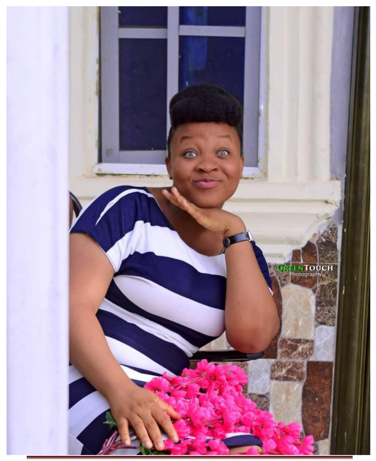
THE MUSINGS OF AYABA